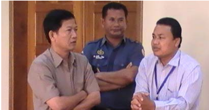
Left: Chief of Siem Reap Prosecutor. Middle: Vice Director Office of Anti-Human Trafficking and Juvenile Protection of Gendarmerie. Right: TFC Executive Director