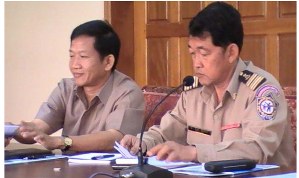
Left: Chief of Siem Reap Prosecutor. Right: Director Office of Anti-Human Trafficking and Juvenile Protection of Police.

The Management of Organization had made visits to other partner organizations and children centers in order to study more on organizing, managing and exchanging experiences which are related to parenting skills, child protection, and especially ensuring good cooperation with partner organizations who have the same objectives. We visited a few organizations in 2011 such as: 1-Don Bosco Centre, 2- Sangkeum Centre for Children, 3- Cambodia Children House of Peace, 4- Green Gecko organization, Cambodian Poor Children Support Orphanage.